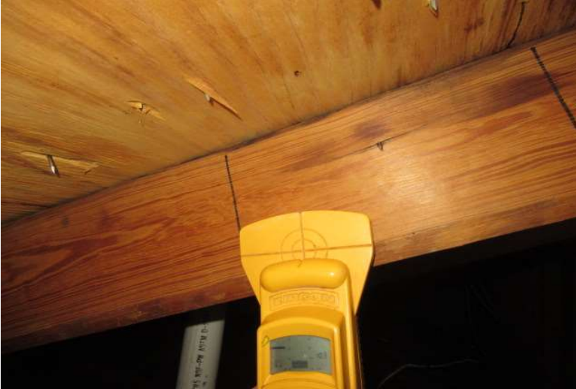
Nail location verified