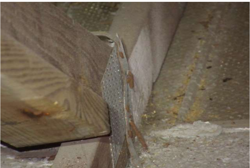
Single strap with at least 3 nails into the truss