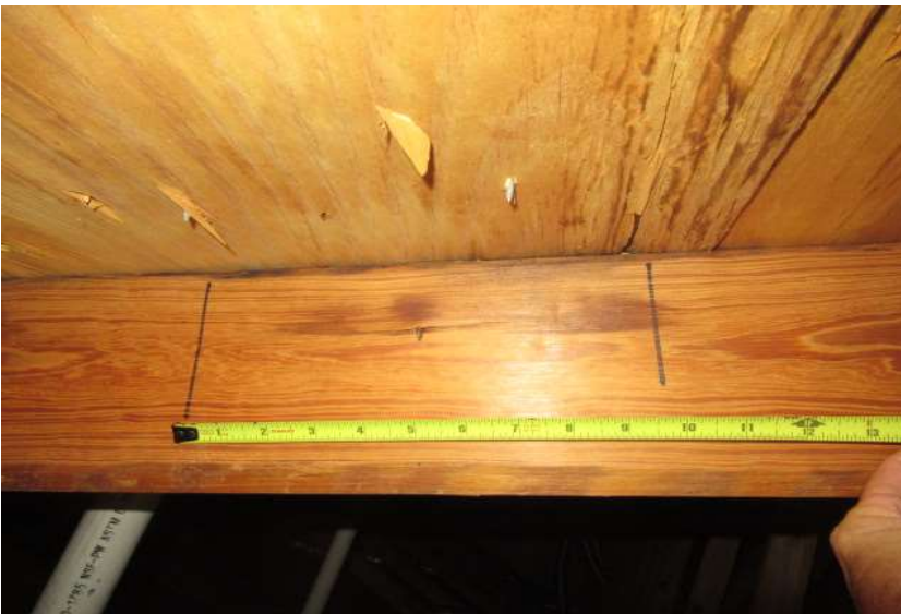
6" spacing in the field