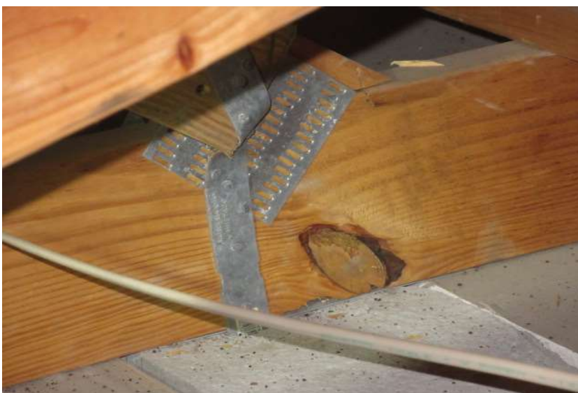
Single strap with at least 3 nails into the truss