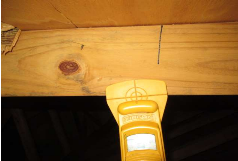
Nail location verified