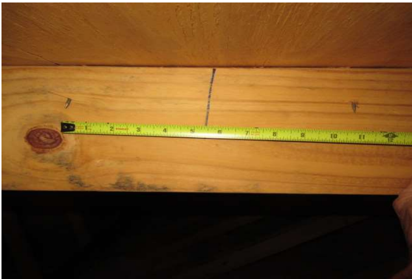
6" spacing in the field