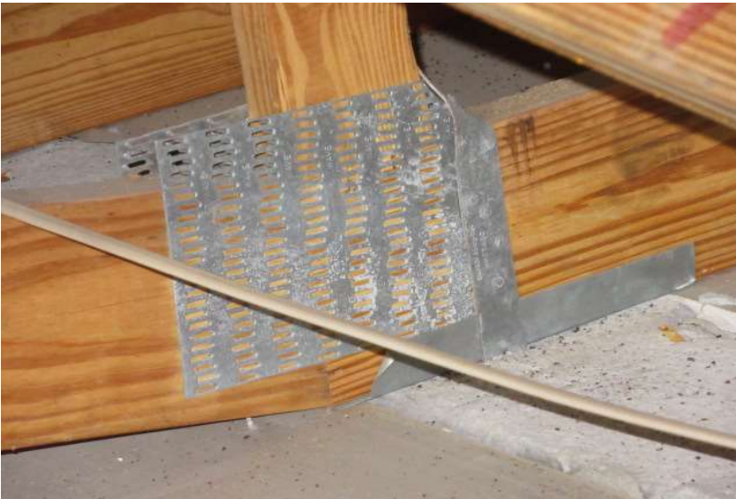
Single strap with at least 3 nails into the truss