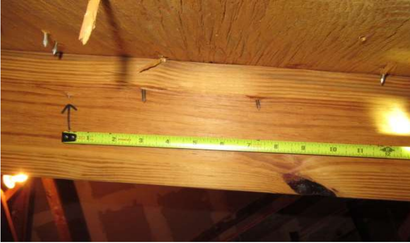
6" spacing in the field